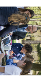
Students in Guatemala, Nicaragua

La Lumiere believes that selfless giving and understanding the needs of one's broader community are integral parts of character formation. We aim to cultivate among our students a willingness and desire to serve, and require participation in community service for graduation. Students regularly serve at Big Brothers Big Sisters, the Humane Society, local nursing homes, and local public elementary schools.