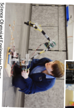
Science Olympiad Engineering Demo

La Lumiere's academic teams are a well-established and popular component of the co-curricular experience. They include Academic, Decathlon, Academic Super Bowl, and the Science Olympiad team, which has qualified for the state tournament every year since 1993.